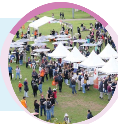
Deaf Festival Sydney 2023