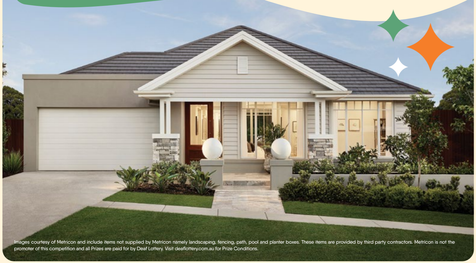
Images courtesy of Metricon and include items not supplied by Metricon namely landscaping, fencing, path, pool and planter boxes. These items are provided by third party contractors. Metricon is not the promoter of this competition and all Prizes are paid for by Deaf Lottery. Visit deaflottery.com.au for Prize Conditions.

Buy, build or renovate your dream home with your choice of builder! • Total value $800K (min $80K spend on home) • Up to $20K Cash • Take the remainder up to $700K in Cashable Gold Bullion